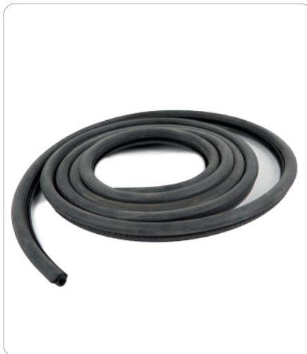
Sealing bands cut in length

Our machine park includes the following appliances: