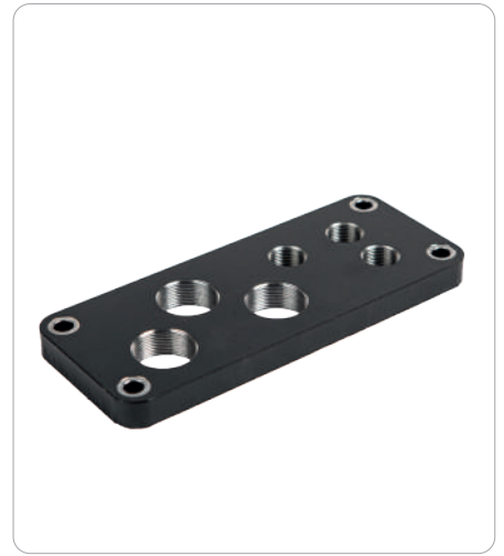
Flanges with threaded holes (cast iron, stainless steel, aluminium)