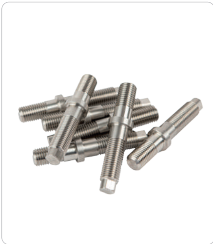
Ridge stud bolt