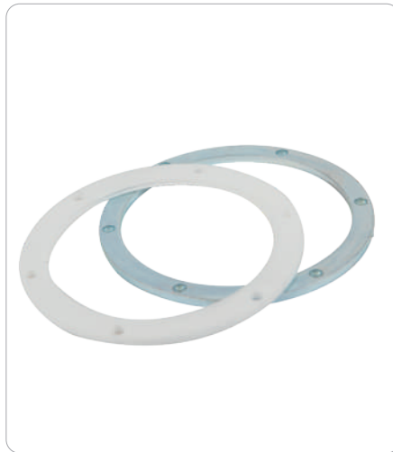
Sealings (PTFE, POM)