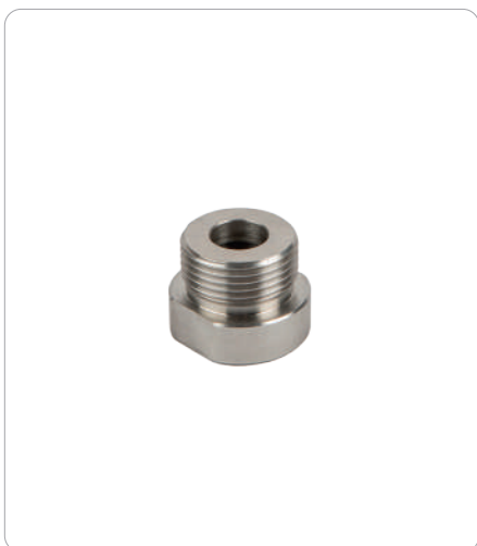
Machined components with threads