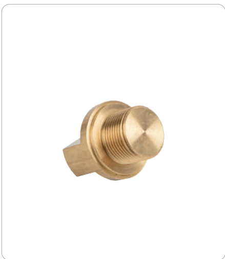
Plugs (brass, copper or other metals)