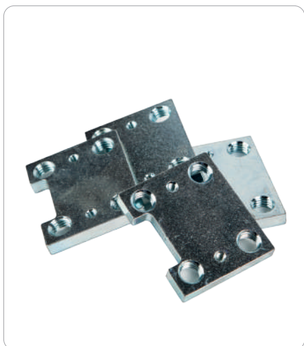
Machined plates with threaded holes