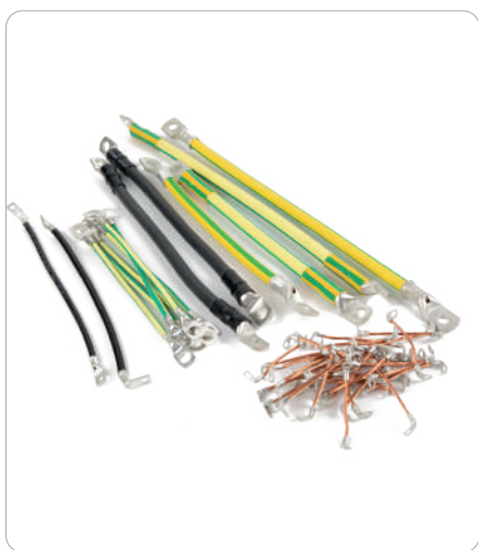
Cables for earthing and other purposes